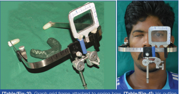
[Table/Fig-3]: Graph grid frame attached to spring bow. [Table/Fig-4]: Iris outline of left eye.